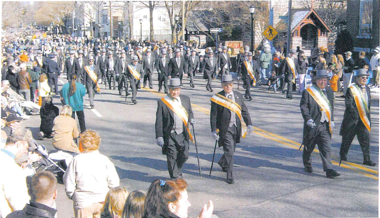
Former Grand Marshals lead Hibernians in the 2005 Parade